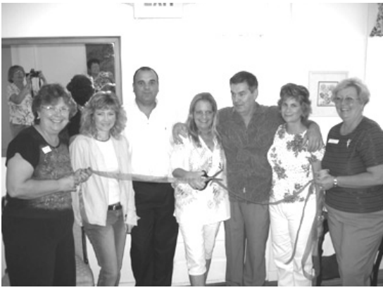
Walk-In Bathtub Store ribbon cutting ceremony