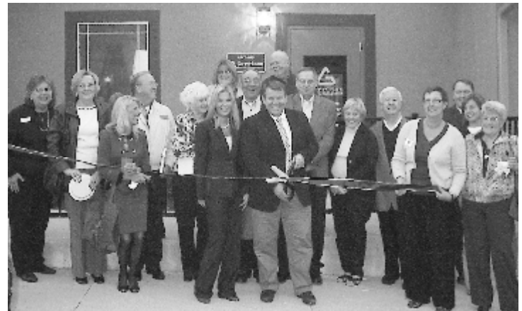
Garrison Wealth Management Ribbon Cutting Ceremony Thursday February 18, 2010

The Mount Dora Area Chamber of Commerce Volunteers are having their Annual Trash-N-Treasures Rummage Sale Saturday & Sunday March 27 & 28, 2010 Starting at 9:00 am in the Chamber Courtyard.