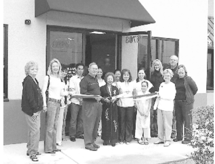
Suong's Nails & Spa Ribbon Cutting Ceremony Saturday January 30, 2010