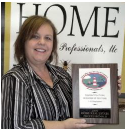
Home Real Estate Professionals, LLC 1-10 Employees